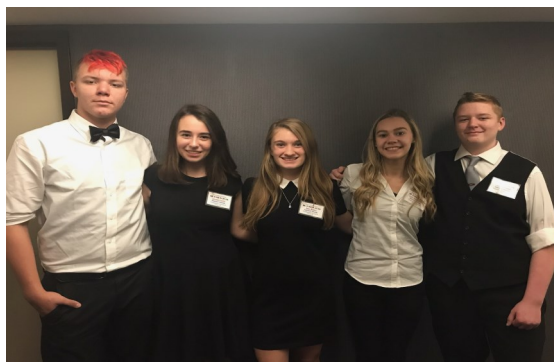
Representing Solomon Islands: (from left to right)