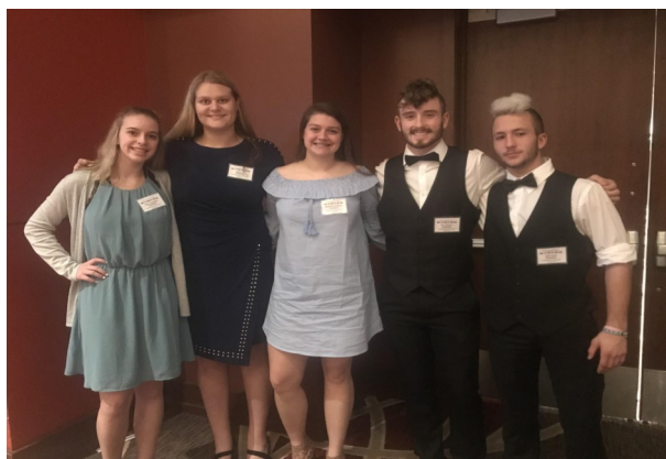
Representing Uzbekistan: (from left to right)