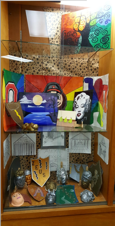
Art case at High School

In honor of Veterans' Day this year, the 5th grade classes created an event called "11 Days of Giving" in an effort to collect at least 111 items to be donated to the Chillicothe VA Medical Center. They are very pleased to share the news that the goal was exceeded by over 400 items. The 5th grade teachers would like to thank the families of our students for being so generous.