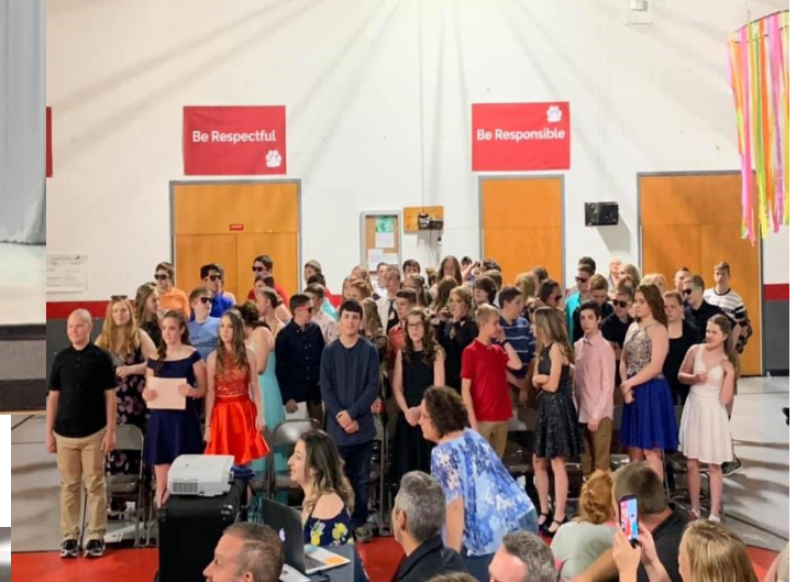
2018-2019 Middle School Recognition