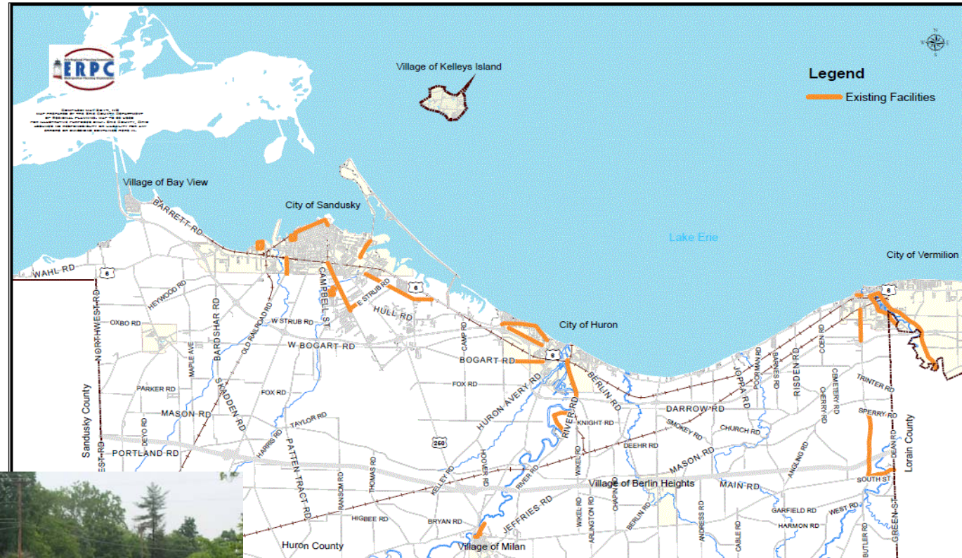
Erie County Bicycle and Pedestrian Existing Facilities