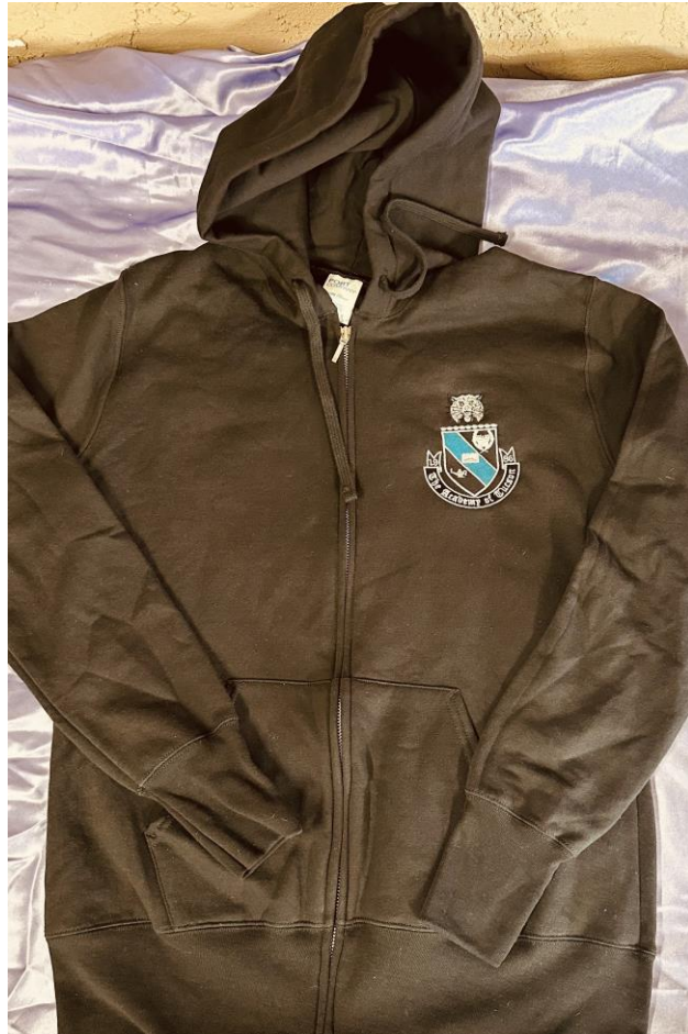
1 - Embroidered Zip Up Hoodie - $50

We have five different designs to choose from, and I am in the process of putting them in the AOT Store on Infinite Campus. You should be able to order and pay from there soon. The sweatshirts are special order items, which means we will collect orders and send those to our T-Shirt company who will then print them and deliver. This will be about a two week turnaround.