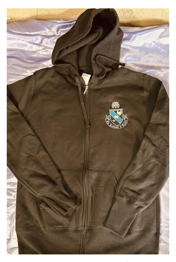
2 - Embroidered Zip Up Hoodie - $50