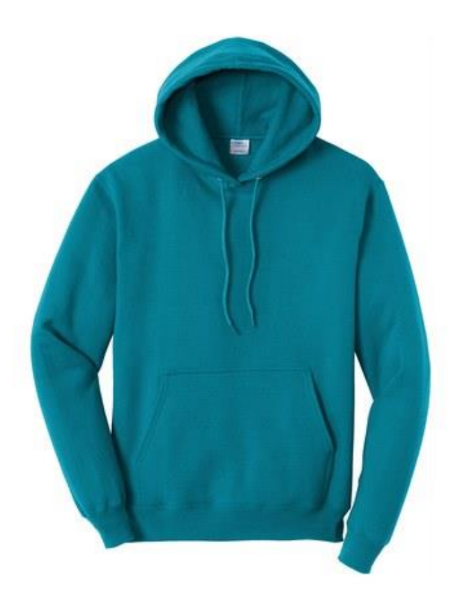
4 - Teal sweatshirt with AOT Emblem outlined in black OR filled-in pink. This will be the same emblem as teh gray sweatshirts.