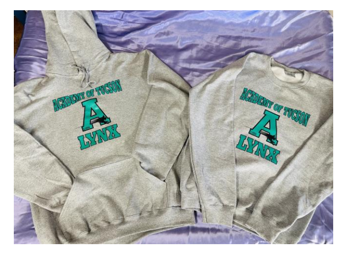
3 - Gray sweatshirt with AOT Emblem with or without hood - $35