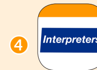
LanguageLine InSight Video Application Icon