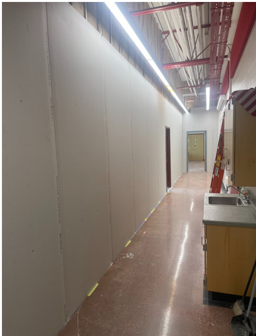
Temporary Classrooms Constructed In the Dr. Ralston Learning Lab