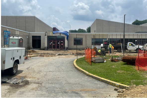
Preparation for the New MS/HS and Athletic Office