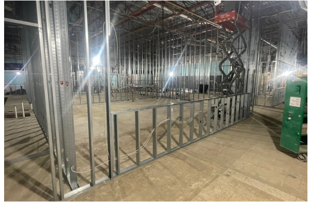
New Classrooms Constructed in Old Library Area