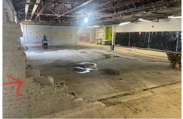
Preparation for the New MS/HS and Athletic Office