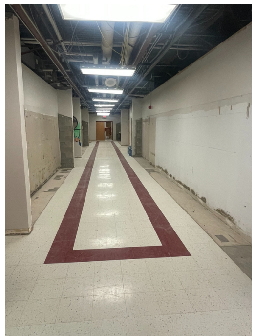
Lockers Removed to Widen Hallways