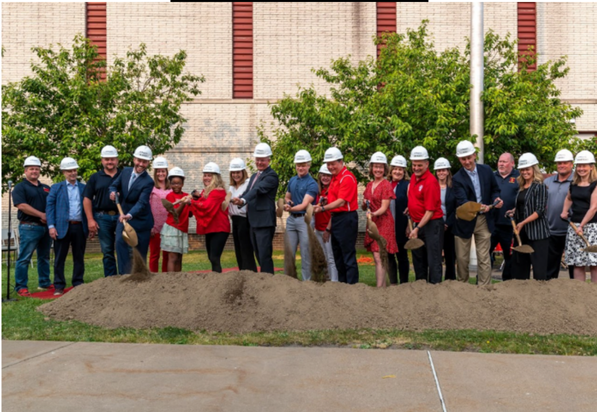
GROUNDBREAKING CEREMONY JUNE 5, 2023

Immediately following our June 5, 2023 groundbreaking ceremony, contractors got to work and have been moving quickly. This summer's project phase primarily focuses on the middle of our high school building. New hallways, additional classrooms, and a new library are being constructed in this area. This project phase is scheduled to be completed before the start of school. Three temporary classrooms have been constructed in the Dr. Tom Ralston Learning Lab to provide additional classroom space during the project. In addition to this work, demolition and construction have begun for the new MS/HS main entrance and the middle school addition.