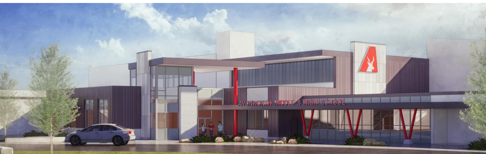
RENDERING OF THE NEW MS/HS ENTRANCE

I'm sure top of mind for our families with students on the secondary campus is the status of the construction/renovation project. First and foremost, as of today, the project phase scheduled for completion this summer is on schedule. If anything changes that would impact our scheduled first day of school for students, August 23, 2023, a message will be sent to inform you.