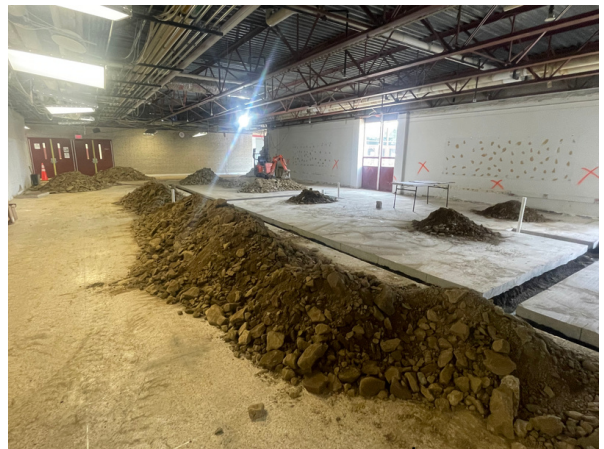
Preparation for the New MS/HS and Athletic Office