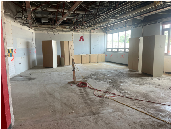
Preparation for the New MS/HS and Athletic Office