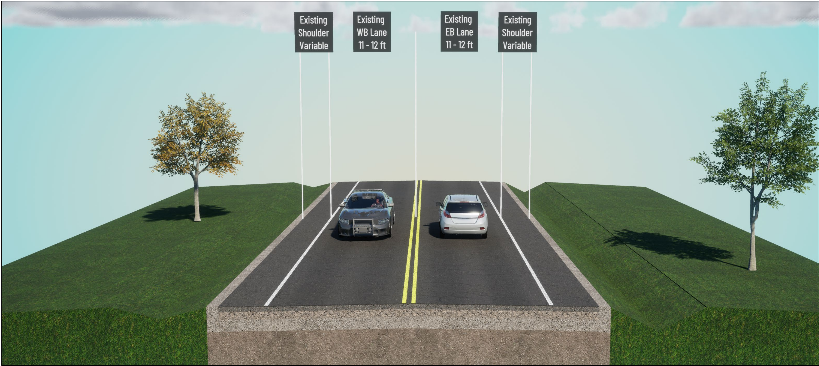
Existing Roadway Condition