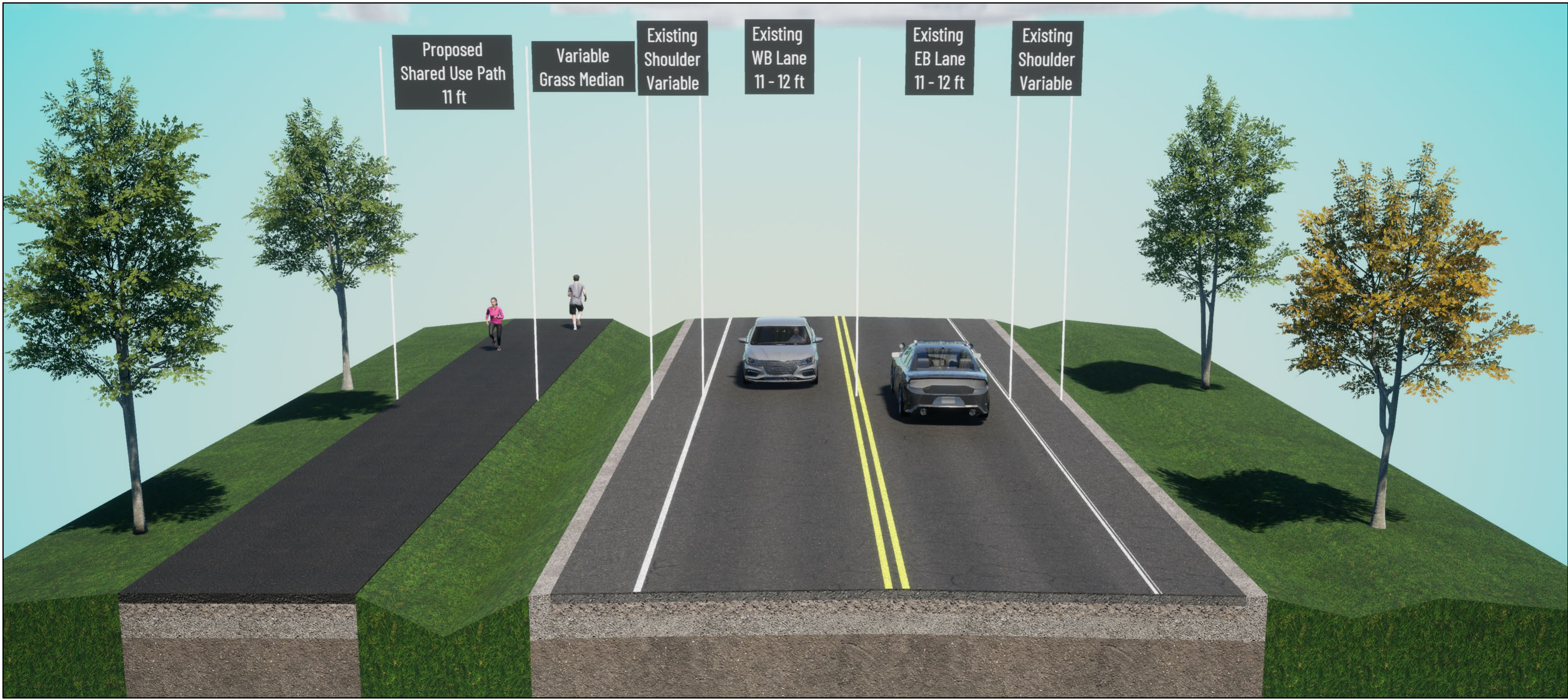
North Shared Use Path Alternative