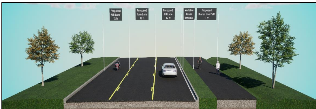
Proposed Road Diet Typical Section with Shared-use Path on South Side

Share your comments with us by Friday, January 9, 2026 , via mail, email, or phone.