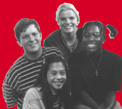
Pictured on the cover (clockwise):