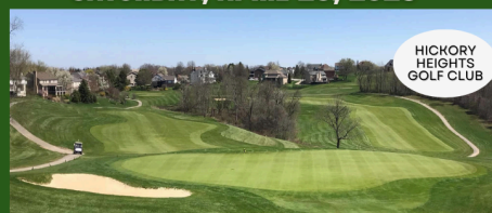
HICKORY HEIGHTS GOLF CLUB