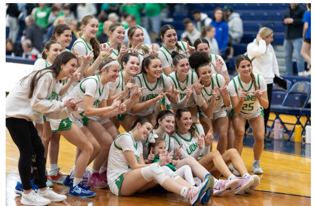
Lady Lions after last Saturday's 67-32 victory over Mars.

South Fayette Girls Varsity Basketball also has a WPIAL championship from 2016.