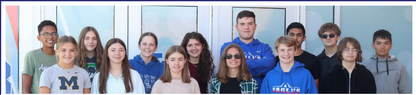
2025-2026 Liberty-Benton Sidewalk Crew