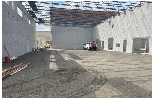
Area D (Looking North to South)