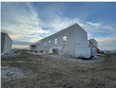
Area E (Looking West to East)