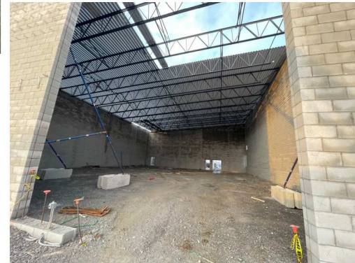
Area C (Main Gym)