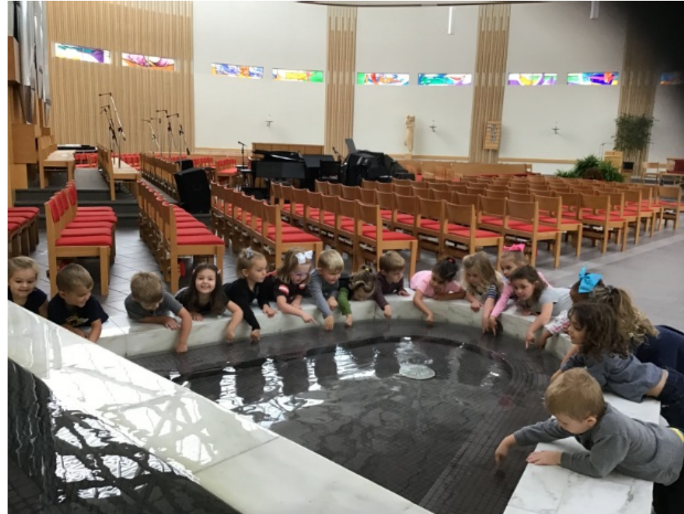
Our PRESCHOOLERS took some time out to visit the Baptismal Font and play together in the gymnasium last week!

defense, ball-handling & conditioning. Clinic will include competitive live games of 3v3 and 5v5. Train like a pro at Cavs Academy. The cost is $75 per participant and each participant will receive a custom Cavs Academy Dri-fit t-shirt, NBA basketball, 2019-2020 Canton Charge ticket to home opener later that night. Register at www.cavsyouth.com