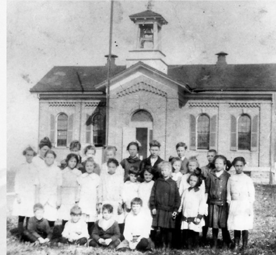
1870: The Schoolhouse in Camp Dennison was opened as a two-room, two-story school.