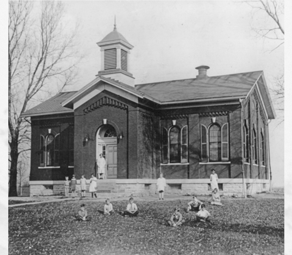
1873: The Washington Heights School on Given Road (The Little Red Schoolhouse) was built.

2014: Indian Hill School District recognized best in the nation for music education according to the National Association of Music Merchants (NAMM); the NAMM Foundation awarded Indian Hill a Best Communities for Music Education.