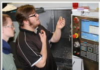
Engineering and Metal Fabrication - Machining