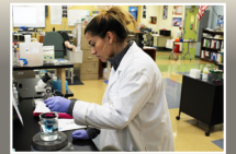
Phlebotomy and Laboratory Science