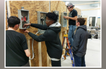
Residential and Commercial Electrical