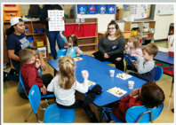
Child and Family Development