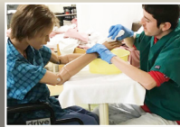
Nurse Assisting and Associated Health Careers