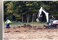
Heavy Equipment Operation and Maintenance