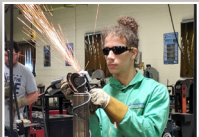
Engineering and Metal Fabrication - Welding