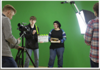
Digital and Visual Communication