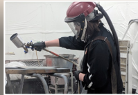
Auto Body and Collision Repair Technology