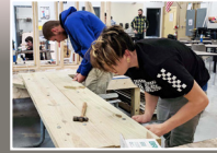
Introduction to Construction Trades