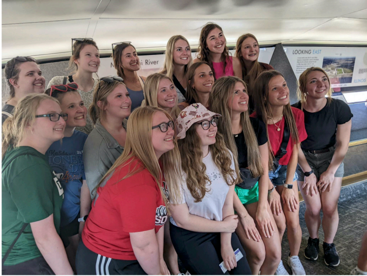
Senior girls made it to the top of The Gateway Arch!