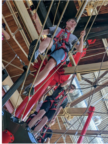
Having fun at Union Station (aquarium, mini-golf, ferris wheel, ropes course, mirror maze, and more)!