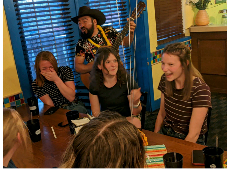
Seniors were entertained during dinner at the Hacienda.