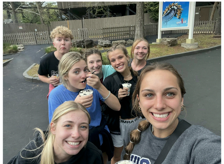
Dippin' Dots at Six Flags (before the storm).