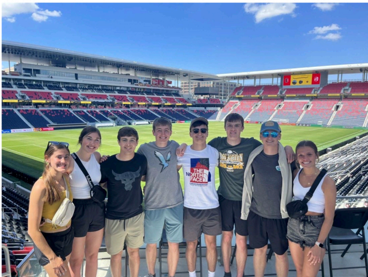
Somehow, some seniors managed to gain entry into the MLS St. Louis City Soccer Club stadium!