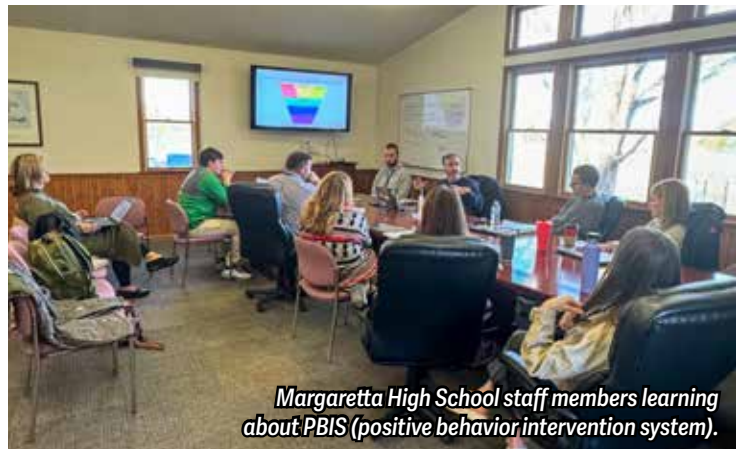
Margareta High School staff members learning about PBIS (positive behavior intervention system).