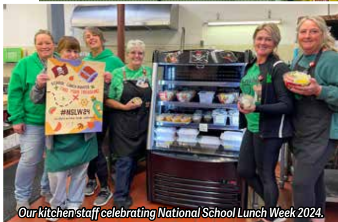
Our kitchen staff celebrating National School Lunch Week 2024.