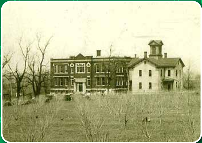
Schoolhouse and school in 1915