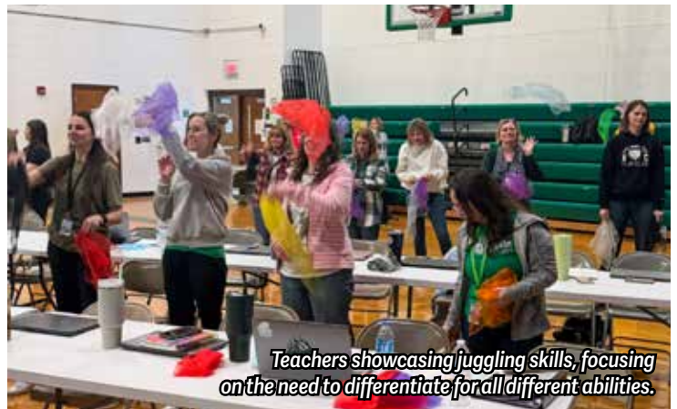
Teachers showcasing juggling skills, focusing on the need to differentiate for all different abilities.