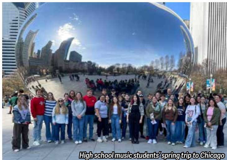
High school music students' spring trip to Chicago