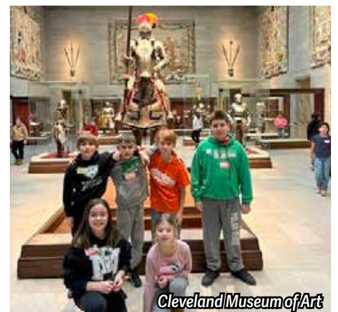
Cleveland Museum of Art