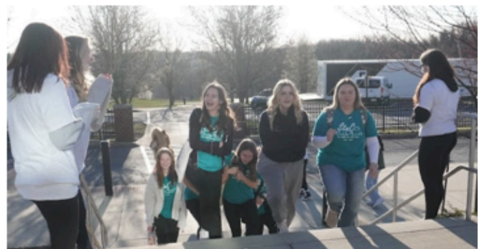
Cheerfully greeting arrivals from each school.