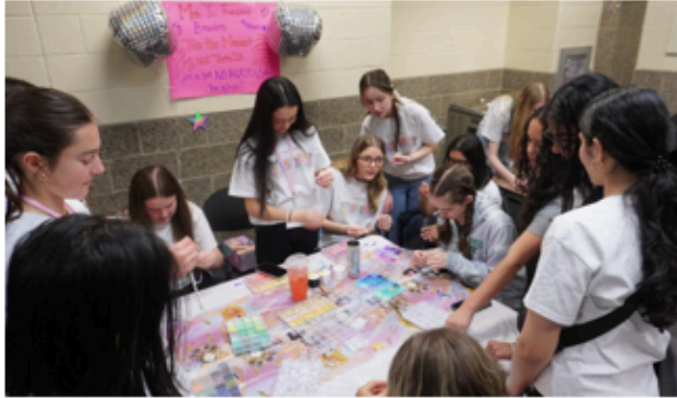
Friendship bracelet making station.