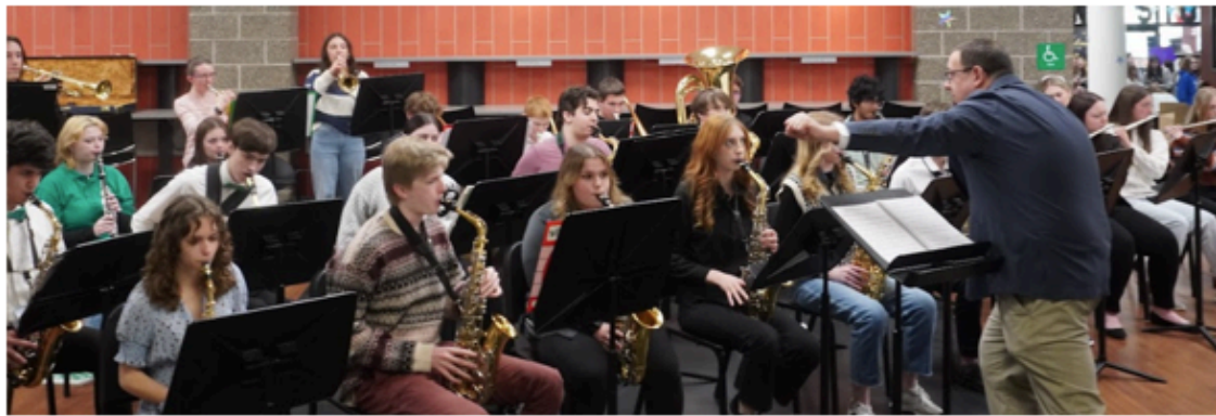
SF Band keeping everyone entertained during registration.