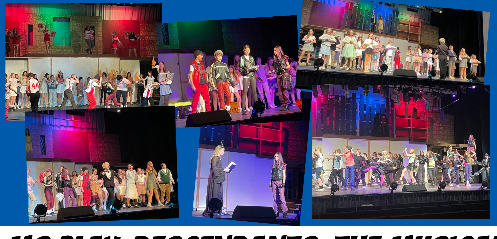
MS PLAY, DESCENDANTS: THE MUSICAL