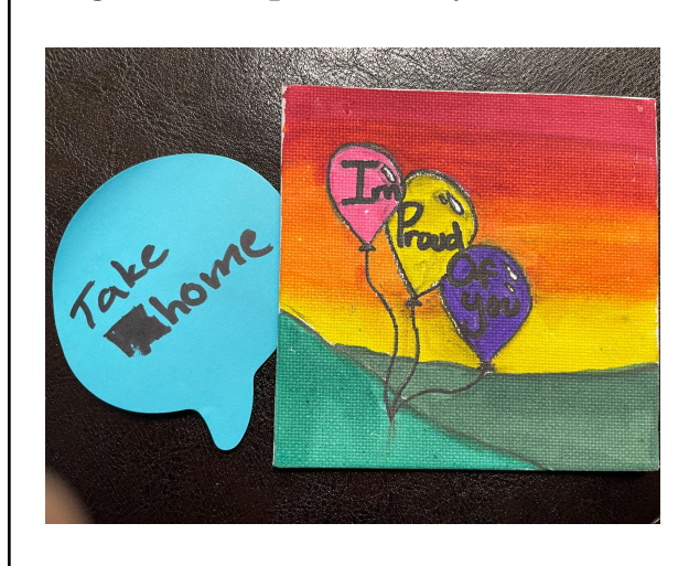
A painting found by a student

Finding them is such a cool thing and when you do find them, especially a little painting it just brightens the person's day.