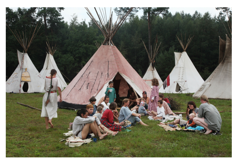
Eastern Europeans dressing as Native Americans call themselves "Indian Hobbyists"