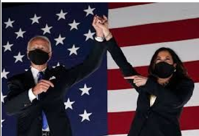
BELOW: Joe Biden Wins Presidential Election