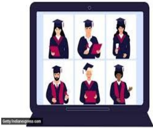
Virtual Senior Year