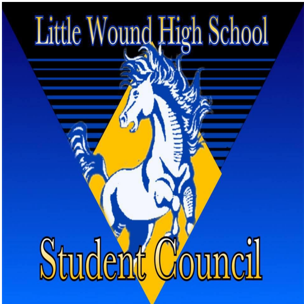
RIGHT: Mustang Council Members