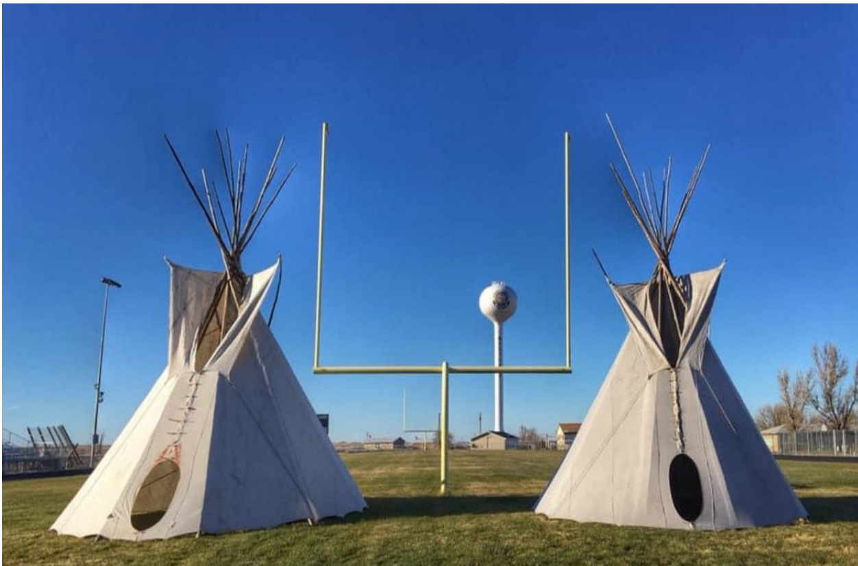
TOP: Buffalo Kill Ceremony setup