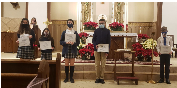
Honoring SS Philip and James Academic Excellence! Quarter 2 Grades 6-8