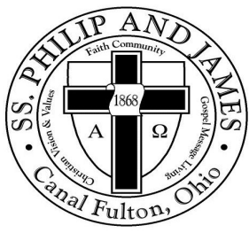
To bring God's love to all people.