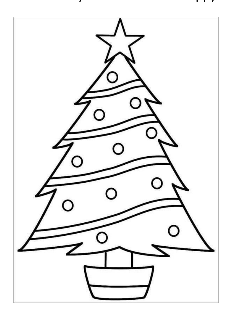
December 20 -- January 2 Christmas Break – Merry Christmas – and Happy New Year!!!