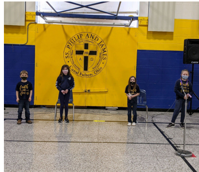
Catholic Schools' Week Fun!