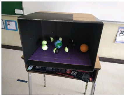
Seventh Grade Science- Phases of the Moon