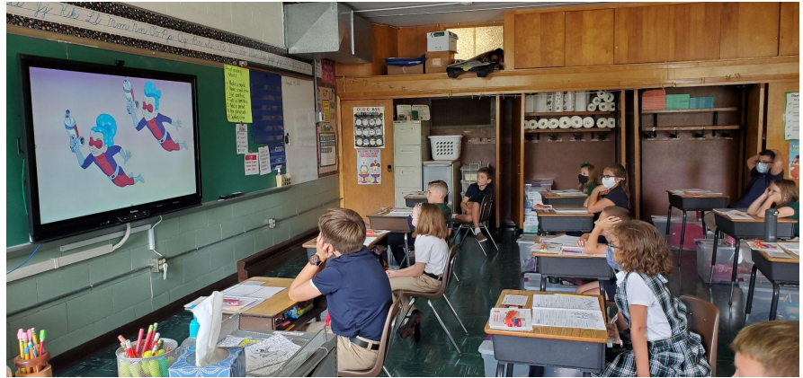
Behind the Bricks at SPJ!!