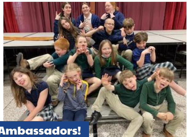
Our Student Ambassadors!