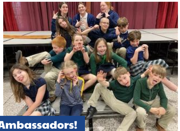
Our Student Ambassadors!