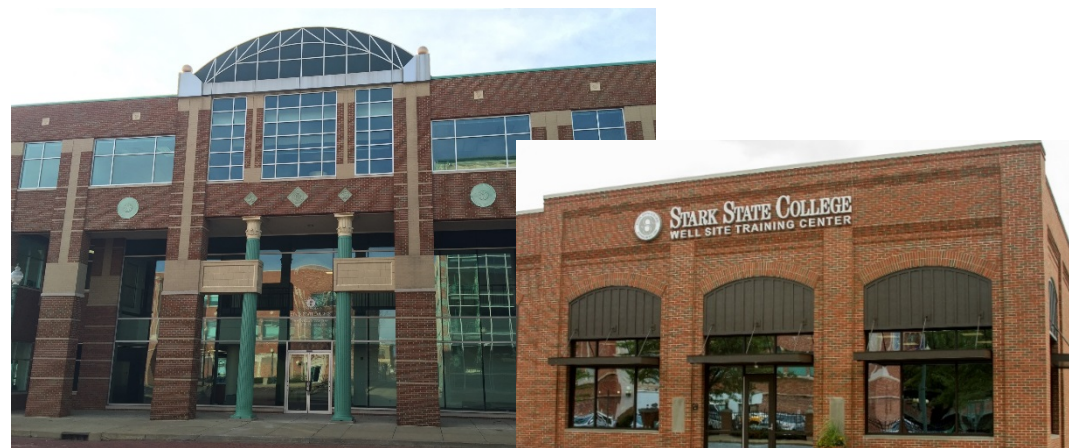
DT Canton Campus & Well Site Training Center