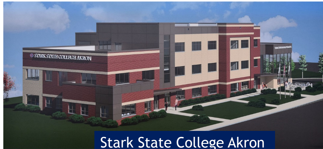
Stark State College Akron