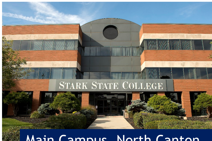
Main Campus, North Canton