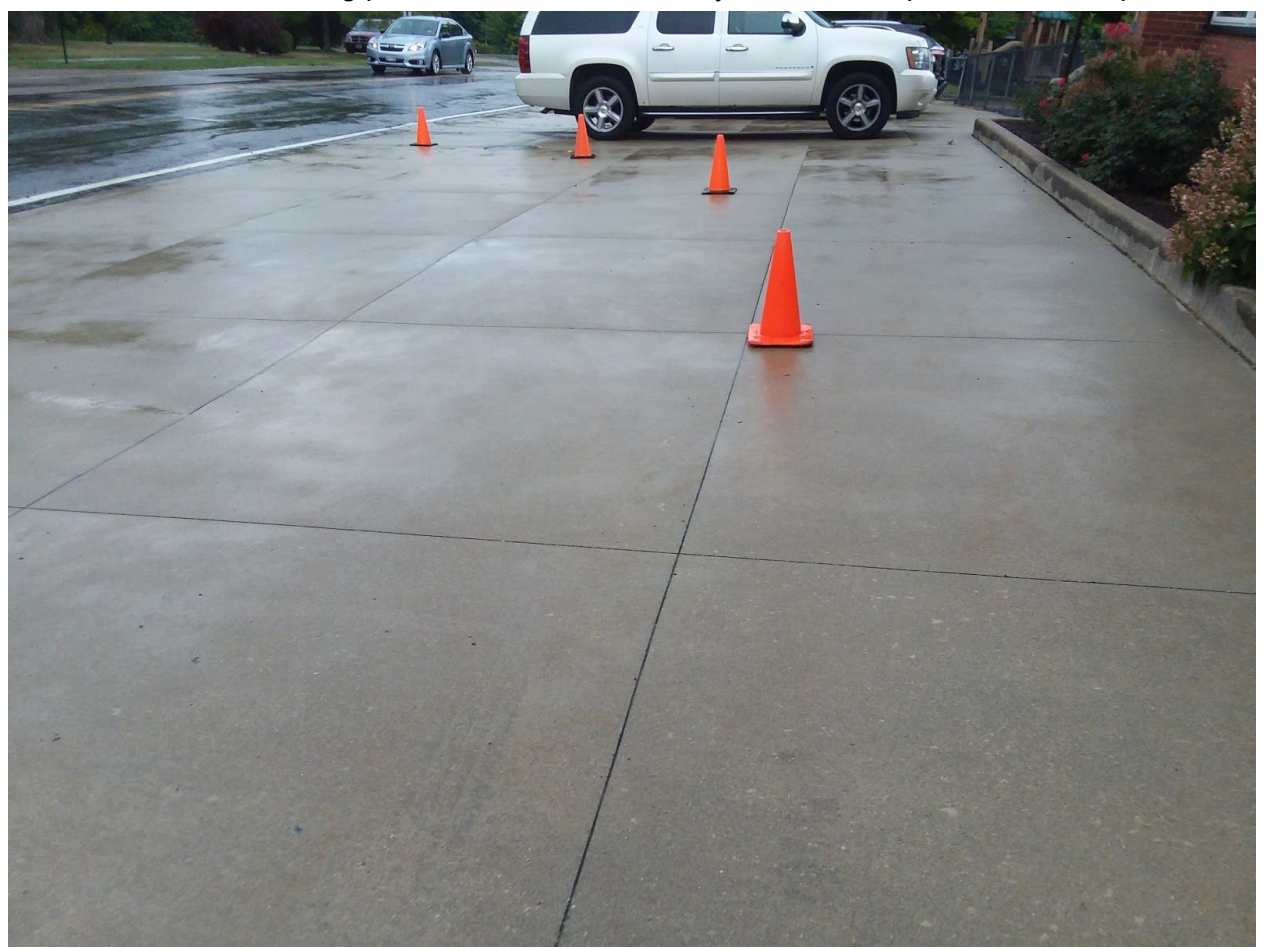
Drop Off- We are in the process of creating a Drop Off Zone in the front of the school. Soon this will be permanently painted. Drop off vehicles are asked to pull off the road and into the Drop Off Zone for safety reasons. Mrs. Montgomery and Mrs. Wolfe will be available to help with easy transport into the school building.

Please review the following procedures to ensure safety with SPJ Drop Off and Pick Up.