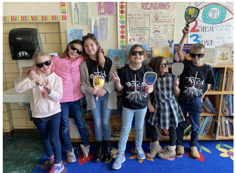
Holy Sacraments (Batman)!

(Sunday, April 24, 2022) The Easter Season is a wonderful time to celebrate the Sacrament of Confirmation. During Pentecost, the Holy Spirit descended upon the disciples and they received the courage to take on the mission Jesus gave them. Confirmation is our own personal Pentecost. This past Sunday, The Holy Spirit descended upon our eighth grade students and they accepted the same challenge given by Jesus to the disciples. (You’ve Got This! Remember you are not alone.) It all starts with Baptism. (Thanks, parents!!) Baptism marks the start of a relationship with Christ. Your soul changed permanently and you were filled with grace from God. Through Confirmation, the Holy Spirit strengthens these graces and seals them all inside you – like a carefully wrapped present! The “gifts” of Courage, Knowledge, Wisdom, Judgment, Wonder, Understanding, and Reverence are yours to help you face the daily challenges of Christian life. Many Catholics adopt the name of a biblical figure or saint that they find inspiring at their Confirmation. This shows the intention to copy their dedication to God. A heavenly friend who will pray and intercede for you on your Christian journey. Meet the spiritual friends of our current eighth grade class! (More information found in LifeTeen- 8 Things You Need to Know About Confirmation)