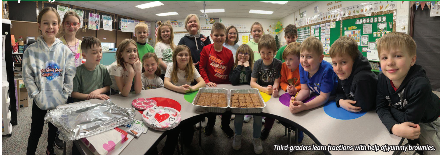
Third-graders learn fractions with help of yummy brownies.