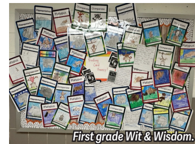
First grade Wit & Wisdom.