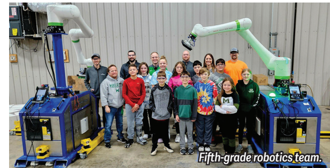
Fifth-grade robotics team.