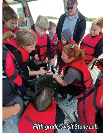
Fifth-graders visit Stone Lab.