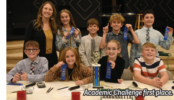
Academic Challenge first place.