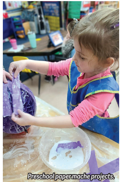
Preschool paper mache projects.