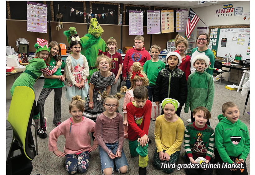
Third-graders Grinch Market.

Our first Elementary Art Show took place on April 22nd in the Elementary school gym to showcase our students' talents!