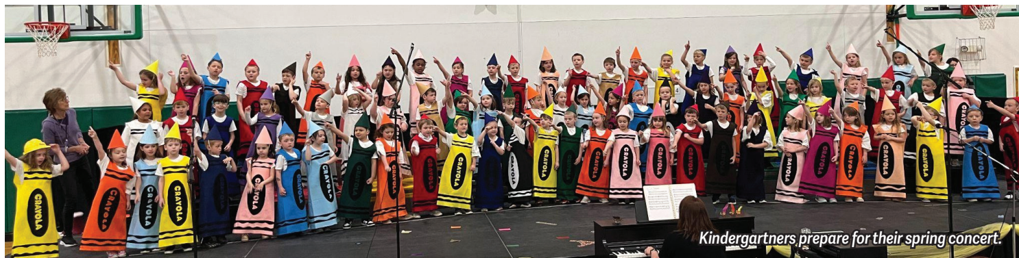
Kindergartners prepare for their spring concert.