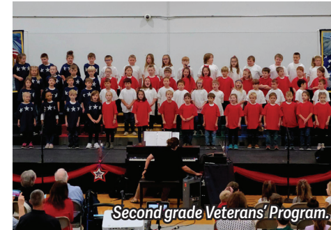
Second grade Veterans' Program.