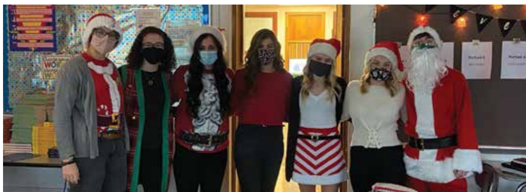
High School Holiday Spirit Week