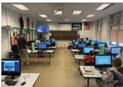
Middle School Computer Classroom