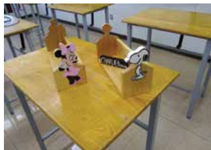
7th Grade project