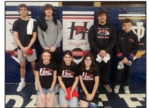
GR All Stars

Spring athletic highlights will be featured in the Summer Dimension Newsletter.