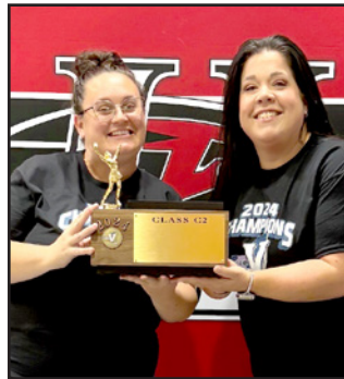
GR Coaches of the Year