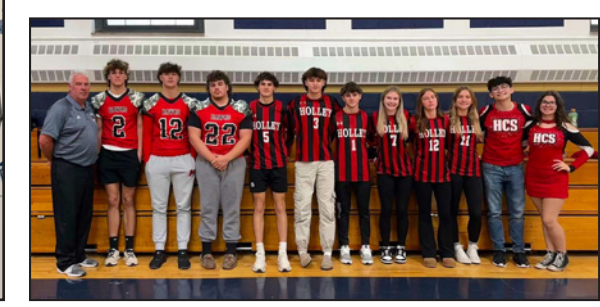
Winter athletic recognitions will be featured in the Spring Dimension Newsletter.