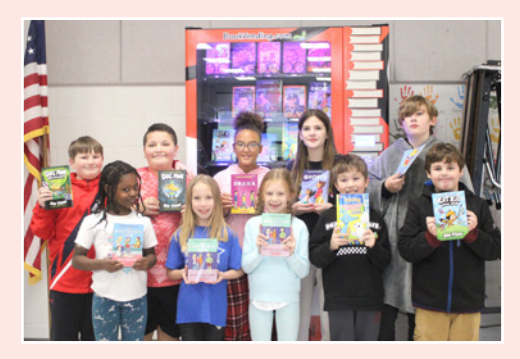
These elementary students were the first to utilize the book vending machine after being nominated for displaying bravery.

What's extra special about these book vending machines is that the students can earn tokens and keep the books free of cost. The district received a federal grant to purchase the vending machines. The Holley PTSA has generously pledged to help keep the machines stocked each school year.