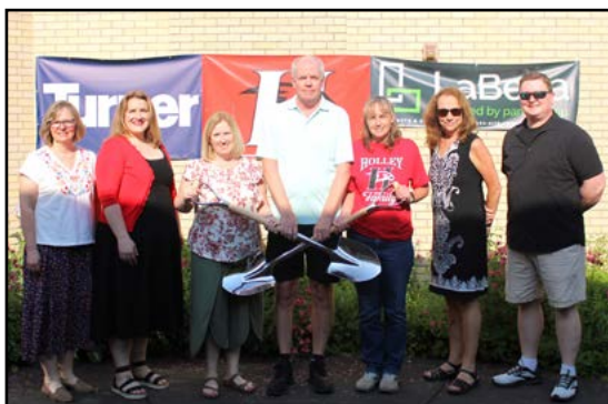
Holley Board of Education at time of ground breaking.