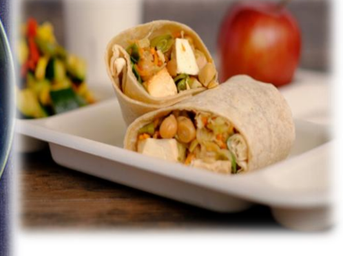
Outrageous Orange Stir Fry Wrap