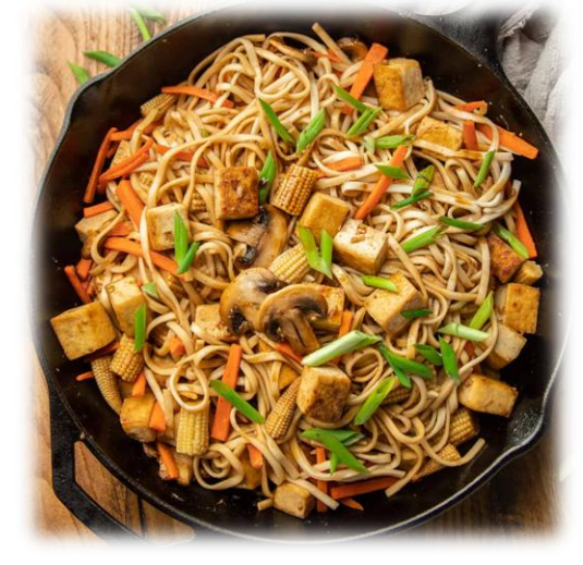
Tofu w/ vegetables over noodles Items and menu may change without notice.

New Features coming this fall. $3.25 per meal