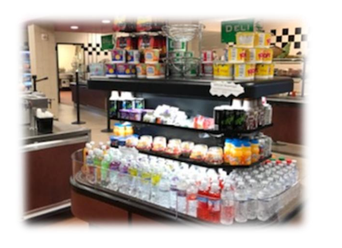
Assorted Beverages – Sold at ALA Carte Pricing