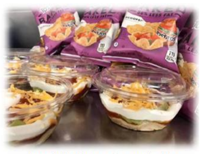
Layered Dip, Hummus, Guacamole, salsa