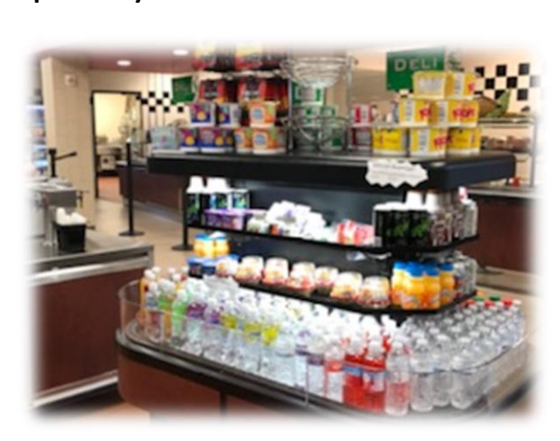
Open Daily 6:55AM until 3:45PM

Limit to one free breakfast snack type bag per day. 2<sup>nd</sup> bag ala carte $1.45