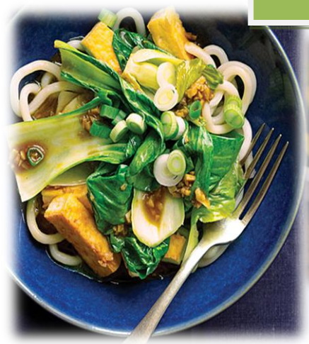
Bok Choy, Noodles and Tofu