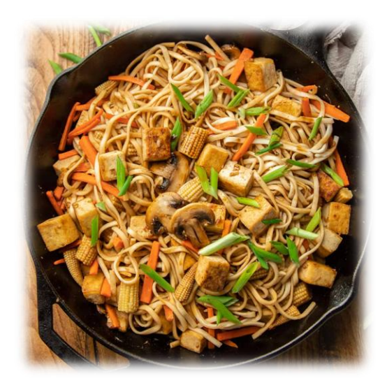
Tofu w/ vegetables over noodles