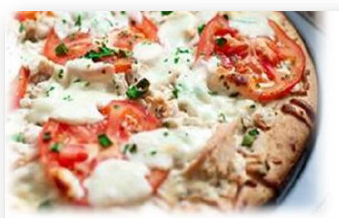
White Pizza with fresh Mozzarella, basil and sliced