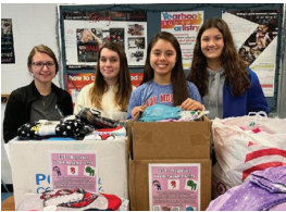
NHS members pose with the 112 pairs of pajamas they collected for children in foster care.