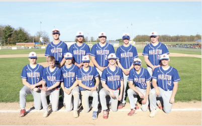
Mapleton Mounties Varsity Baseball.